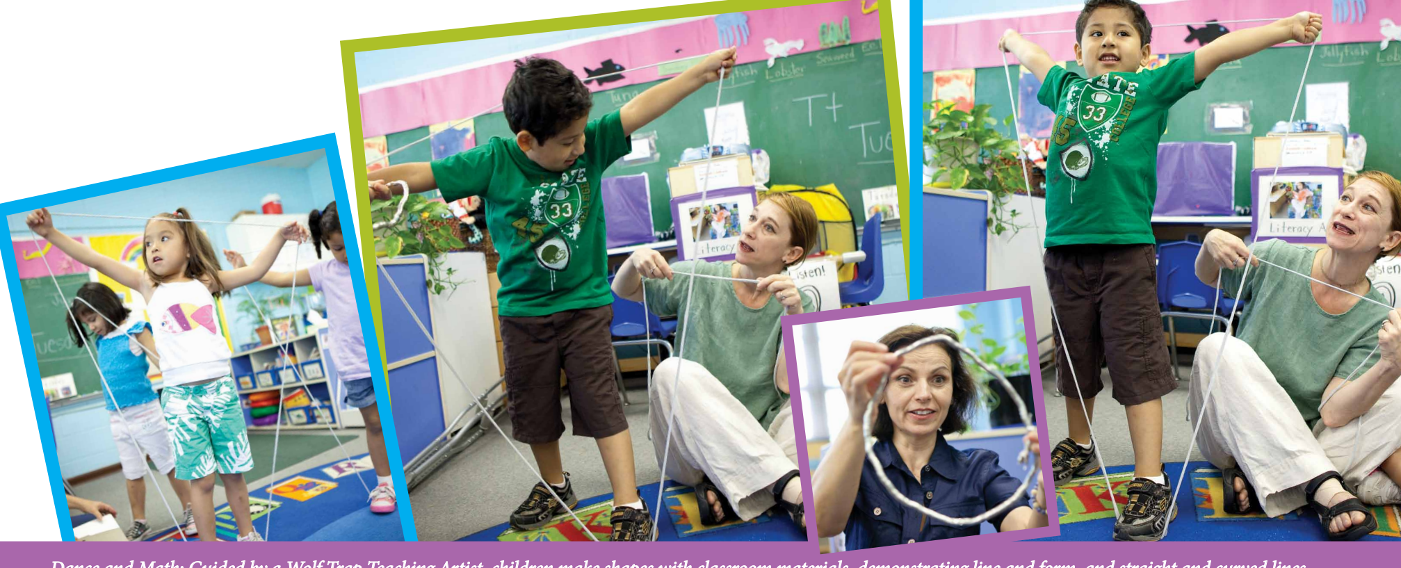
Dance and Math: Guided by a Wolf Trap Teaching Artist, children make shapes with classroom materials, demonstrating line and form, and straight and curved lines as they translate dance movements into geometric configurations.

These interactive, inspiring sessions will increase confidence in working with young children as participants learn how to make the natural connection between performing arts and children's STEM learning. As one educator at a recent Wolf Trap STEM Summer Institute notes, "Math is everywhere. There are many ways to make connections to it. We just need to be intentional in our teaching."