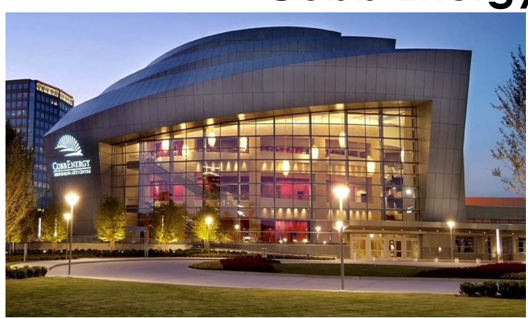
Cobb Energy Center for the Performing Arts 2800 Cobb Galleria Pkwy Atlanta, GA 30339