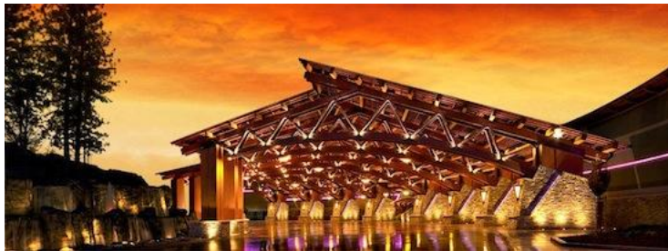
Red Hawk Casino

Since the 1970s, a battle has raged between the State and Tribal governments surrounding tribal sovereignty. States want to regulate activities on reservations, but the federal government has repeatedly upheld tribal sovereignty. This ruling opened the door to Native American casinos, bingo halls and other gaming establishments representing a $27 billion business annually. Local communities frequently resist applications to build gaming resorts citing a reduction in county taxes and unconvincing evidence of positive economic impact for tribal members. In 1988, Congress passed the Indian Gaming Regulation Act stating that tribes and states must have agreements for gaming activities, but only the Federal Government can regulate gaming.