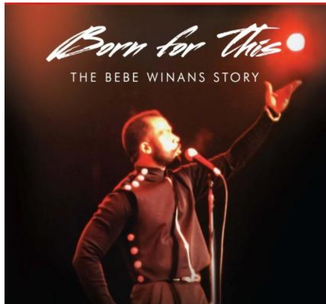
Born for This: The BeBe Winans Story Alliance Theatre Show Art

This world premiere is a recipient of an Edgerton Foundation New Play Award.