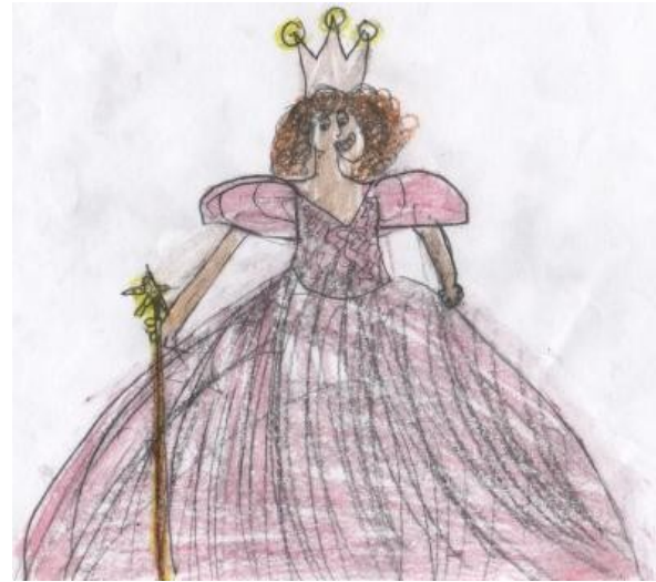
Glinda the Good Witch of the South

“Click your heels together three times....”