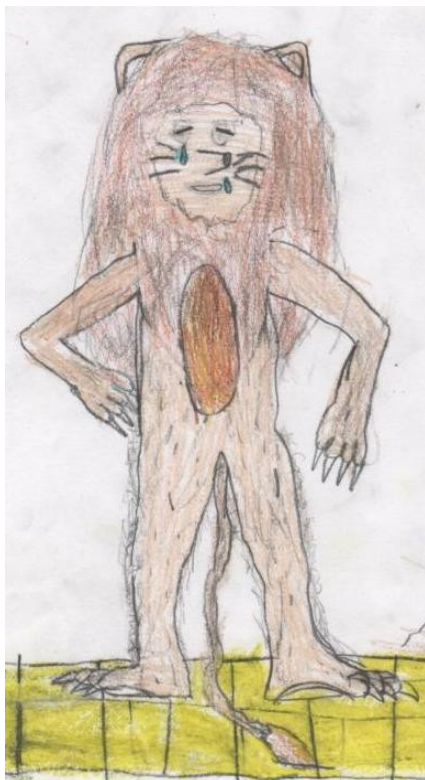
The Cowardly Lion