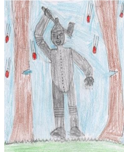
The Tin Man