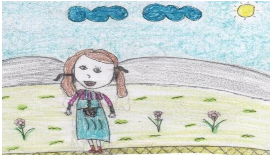
Dorothy Gale "There's no place like home"

EMERALD CITY KANSAS MUNCHKINLAND TOTO YELLOW BRICK ROAD