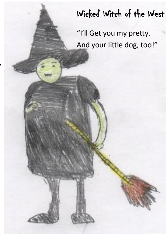
Wicked Witch of the West

“I’ll Get you my pretty. And your little dog, too!”